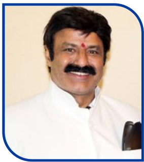
Padma Bhushan Nandamuri Balakrishna